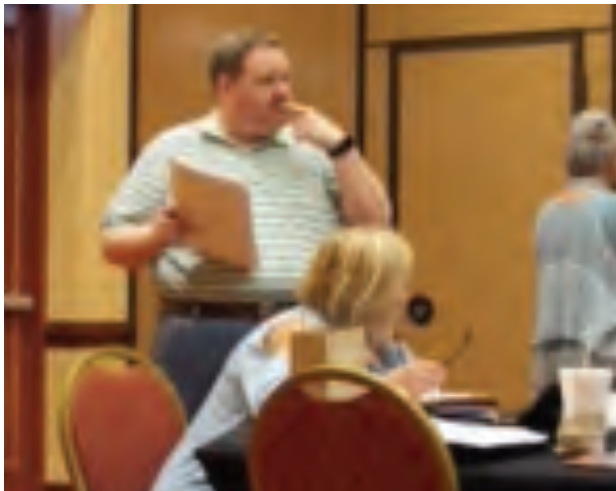
Our Board of Directors working for us at the board meeting prior to the V.G. Young Conference in San Marcos.